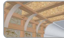
Top & Bottom Reveal

Still have questions? View the photo galleries or give us a call toll free.